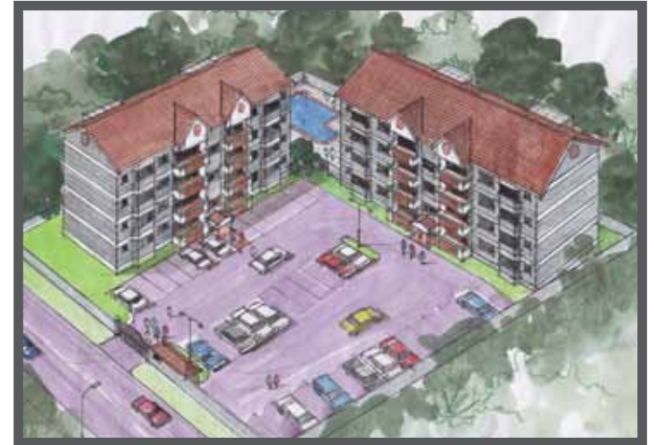
PEARL HEAVEN 16 EXECUTIVE FLATS OF THREE BEDROOMS ON WESTLANDS AVENUE WESTLANDS