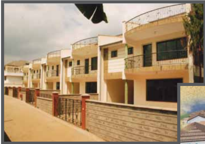
FIVE PEARL 5 LUXURY MAISONNETTES OF FOUR BEDROOMS ON NGAO ROAD PARKLANDS