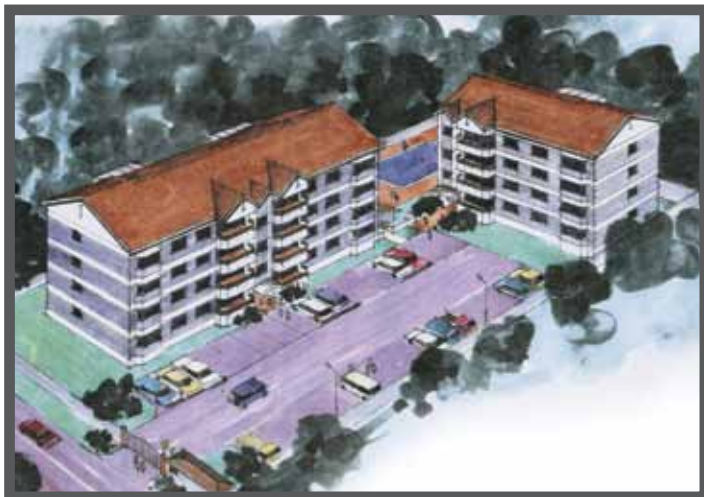
PEARL COMFORTS 12 EXECUTIVE APARTMENTS OF FOUR BEDROOMS ON RHAPTA ROAD WESTLANDS