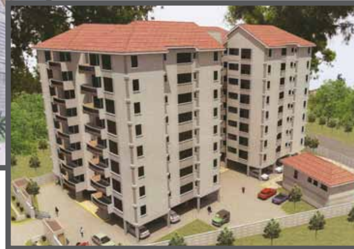
PEARL TOWERS 40 LUXURY FLATS OF THREE BEDROOMS ON GATUNDU ROAD KILELESHWA