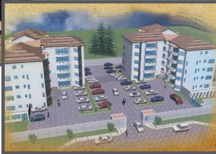
PEARL PARK 20 LUXURY FLATS OF THREE BEDROOMS ON MAHIGA MAHIRU ROAD OFF CHURCH ROAD WESTLANDS