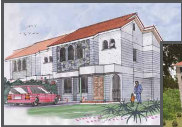
PEARL HOMES 8 LUXURY MAISONNETTES OF FOUR BEDROOMS ON EAST CHURCH ROAD WESTLANDS