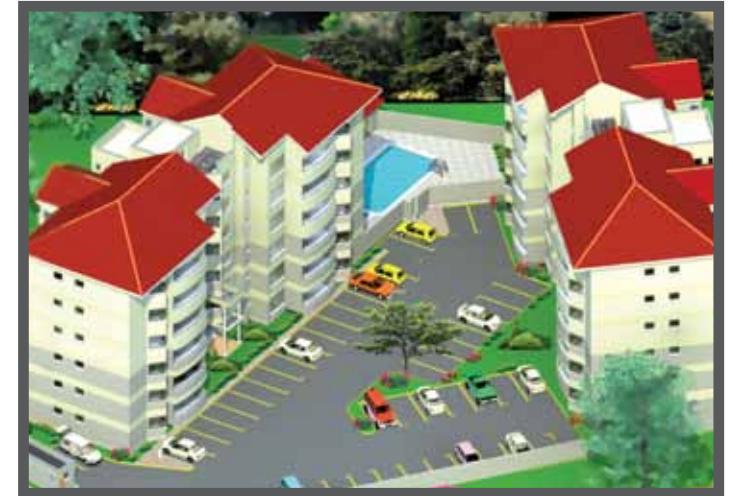
PEARL COURT 32 LUXURY FLATS OF THREE BEDROOMS ON TABERE CRESCENT KILELESHWA