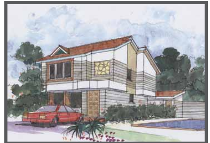
PEARL VILLAS 16 LUXURY MAISONNETTES OF FOUR BEDROOMS ON MUSA GITAU ROAD LAVINGTON