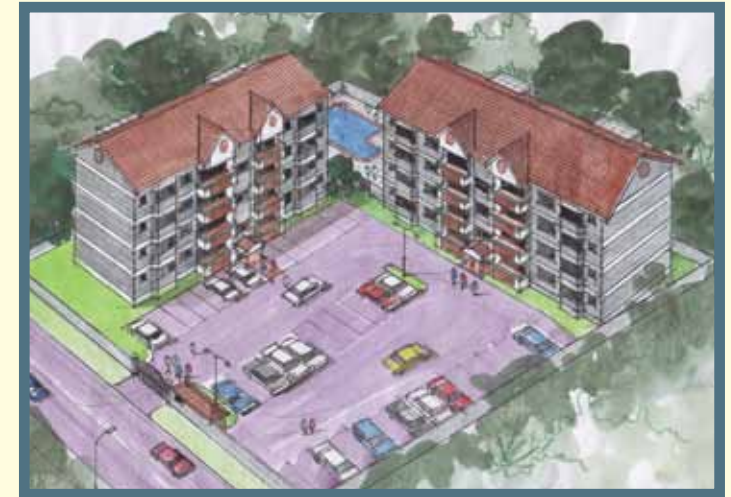
PEARL HEAVEN 16 EXECUTIVE FLATS OF THREE BEDROOMS ON WESTLANDS AVENUE WESTLANDS