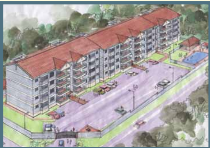
PEARL PARK 20 LUXURY FLATS OF THREE BEDROOMS ON MAHIGA MAHIRU ROAD OFF CHURCH ROAD WESTLANDS