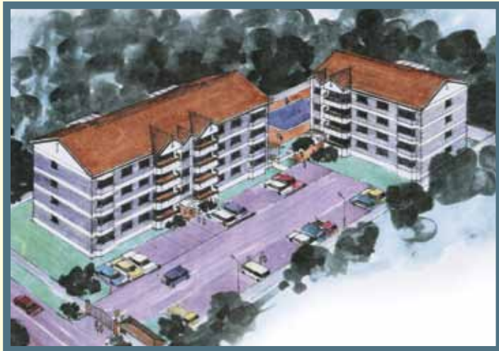
PEARL COMFORTS 12 EXECUTIVE APARTMENTS OF FOUR BEDROOMS ON RHAPTA ROAD WESTLANDS