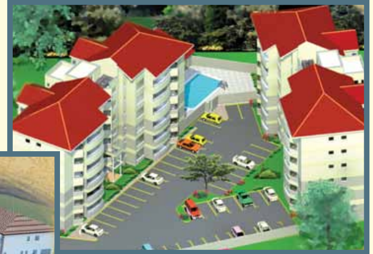
PEARL COURT 32 LUXURY FLATS OF THREE BEDROOMS ON TABERE CRESCENT KILELESHWA